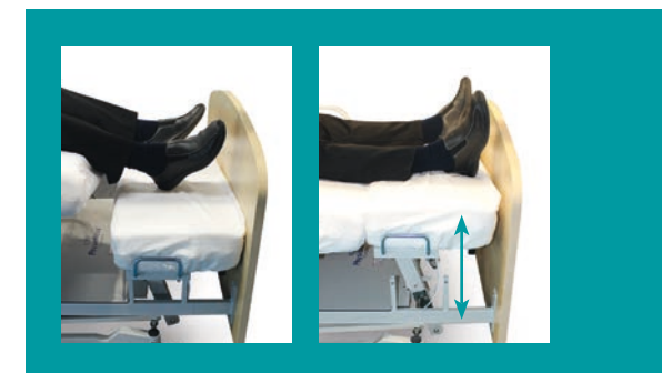
The Rotoflex is the only rotational bed with optional rising heel support (patented)