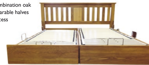
A double combination oak bed with separable halves for easier access

Handcrafted in beautiful solid oak, these stylish beds bear no resemblance to a hospital type bed in looks, but can have all of the assistive function that you need in helping to maintain independence at home.