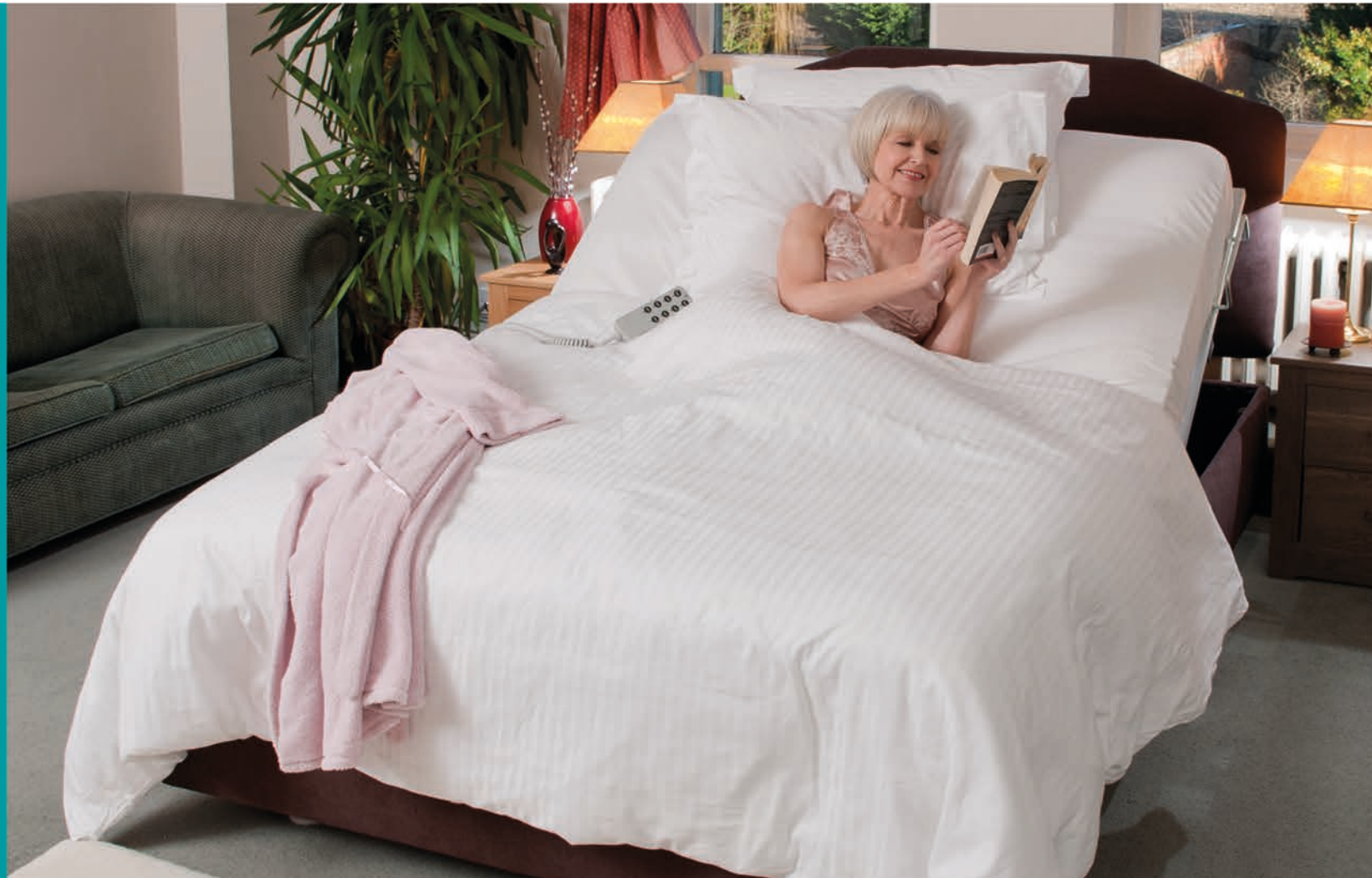
Bed shown – 4'6" Theramatic finished in a Panvelle Chocolate one piece enclosure and matching headboard

Who said that a single bed has to be 3' (90cm) wide? Your upholstered Theraposture bed can be any size that you choose up to 5' (152cm) wide.