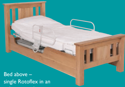
Bed above – single Rotoflex in an oak surround