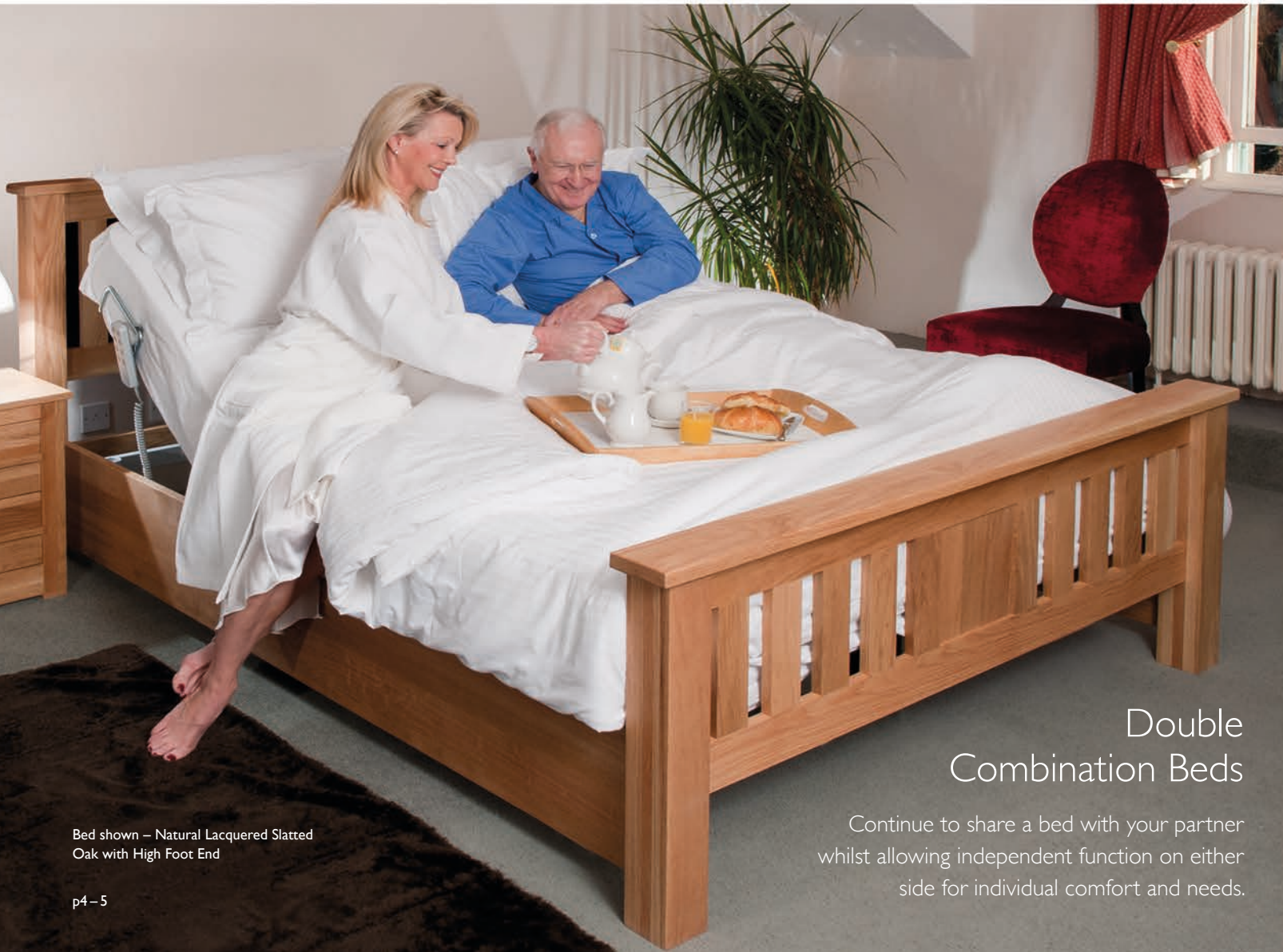
Bed shown – Natural Lacquered Slatted Oak with High Foot End