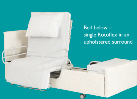
Bed below – single Rotoflex in an upholstered surround