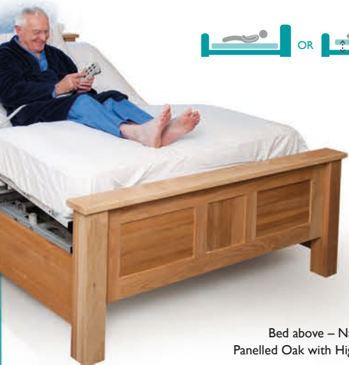
Bed above – Natural Oiled Panelled Oak with High Foot End