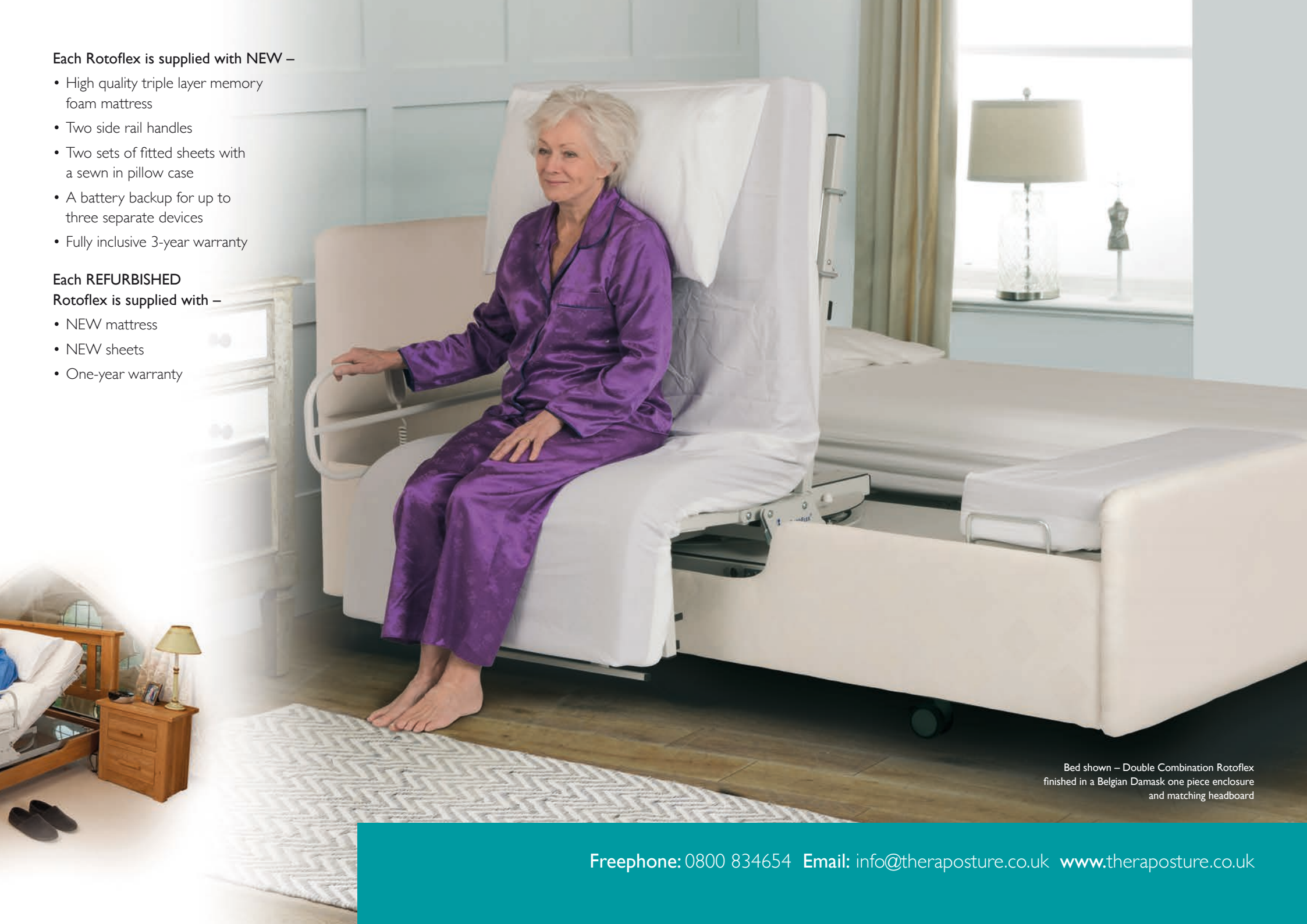
Bed shown – Double Combination Rotoflex finished in a Belgian Damask one piece enclosure and matching headboard